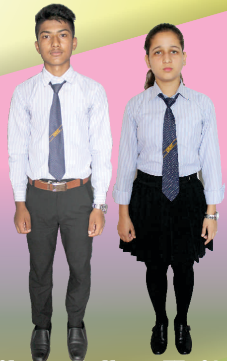
Pupils in College Uniform

Female Students: White striped shirt, black skirt/pants, blue socks, and black shoes and college tie / Campus T-Shirt.